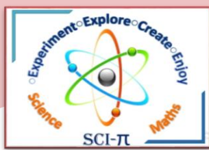
Sci - \pi Science Club