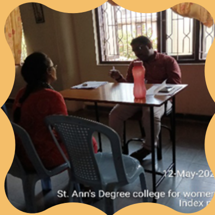
12-May-2023 St. Ann's Degree college for women Index n