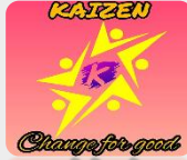
Kaizen HR Club